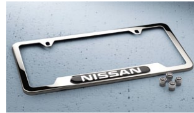
Nissan Chrome License Plate Frame and Valve Stem Caps Package