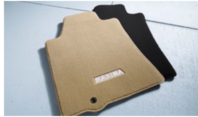
Carpeted Floor Mats