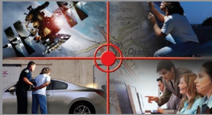
Nissan VTRS (Vehicle Tracking and Recovery System)

Nissan Maxima shown with Rear Decklid Spoiler, Moonroof Wind Deflector and Splash Guards.