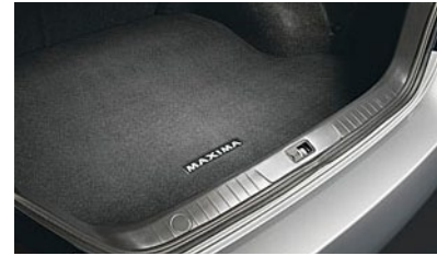
Carpeted Trunk Mat