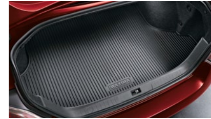
Rubber Trunk Protector