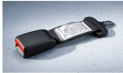
Seat Belt Extender