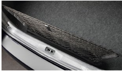
Hide-away Trunk Net (Open and Closed)