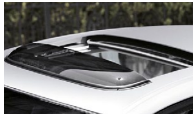
Moonroof Wind Deflector