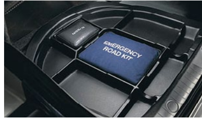
Trunk Sub-floor Organizer Kit