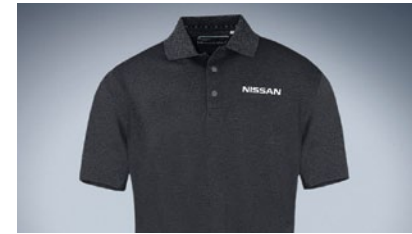
Men's Cutter & Buck Polo – Charcoal www.nissancollections.com

For details, visit NissanUSA.com/accessories