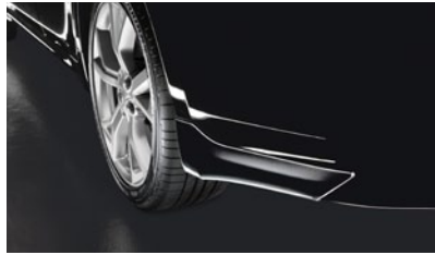
Splash Guards (4-piece)