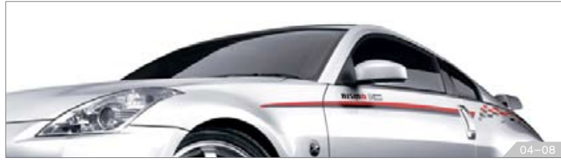
Graphics 3 - Z ®