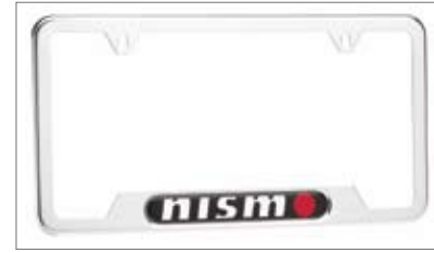
License Plate Frames 1