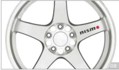
18" Forged Wheels, Silver 1 - Z ®