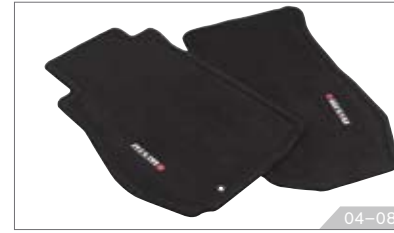
Floor Mats, Carpeted 1 - Z ®