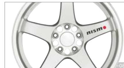
19" Forged Wheels, Silver 1 - Z°