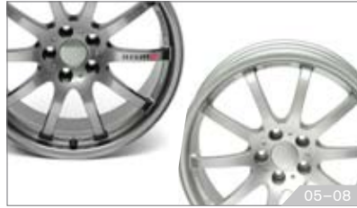
19" Forged Wheels, Silver or Gunmetal 1 - Maxima