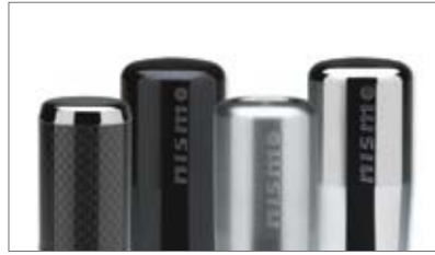
Shift Knobs 1