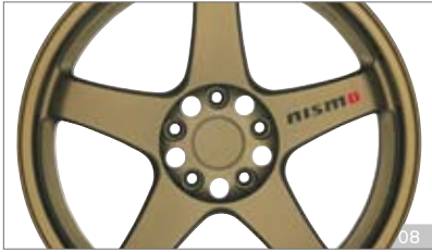
18" Forged Wheels, Bronze 1 - Z ®