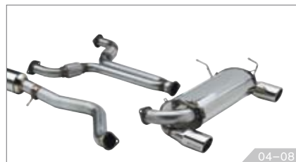
Cat Back Exhaust 1 - Z°