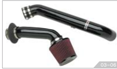
Cold Air Intake 3 - Z ®