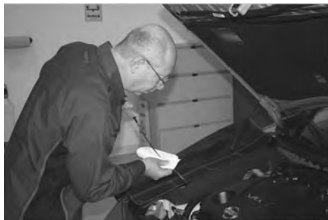
For All Your Service Needs

Your Nissan dealer is a full-service maintenance and repair center. We recommend using authorized Nissan Service and genuine Nissan Parts that we have designed for their reliability, safety and suitability for your Nissan vehicle. We are committed to providing you with quick, efficient, and competitively priced service and parts.